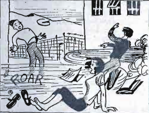
STUDENT PARKING LOT