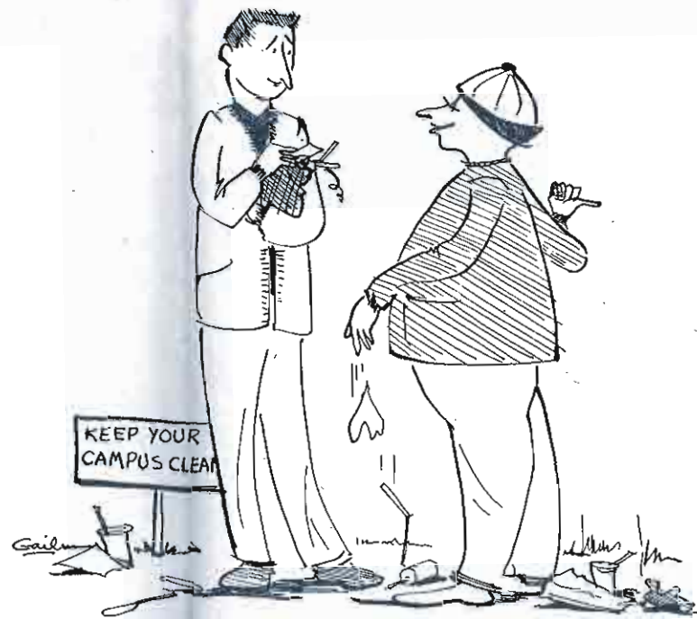
"THE TRASH CAN? — OH! YOU MEAN THAT THING OVER THERE IN THE CLEAN SPOT!"